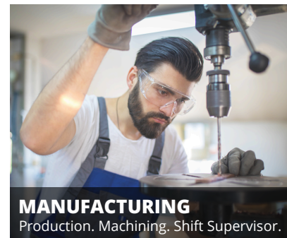
MANUFACTURING Production. Machining. Shift Supervisor.