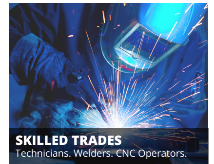
SKILLED TRADES Technicians. Welders. CNC Operators.