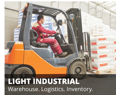
LIGHT INDUSTRIAL Warehouse. Logistics. Inventory.