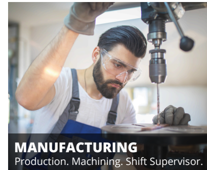
MANUFACTURING Production. Machining. Shift Supervisor.